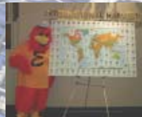
Earnie the Early Bird with a map of all the Credit Union countries worldwide